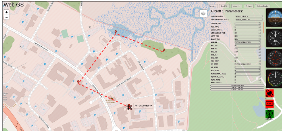
Figure 1: The current interface for setting parameters in ICAROUS.

The Monitoring ICAROUS project, a work-in-progress joint effort at NASA, will demonstrate the integration of robust requirements-based runtime verification applied to an autonomous flight system for unmanned aircraft using FRET, Copilot, and ICAROUS. This project brings together work that the NASA formal methods team has been doing for many years on requirements elicitation and specification, runtime verification, and assured autonomous aircraft software.